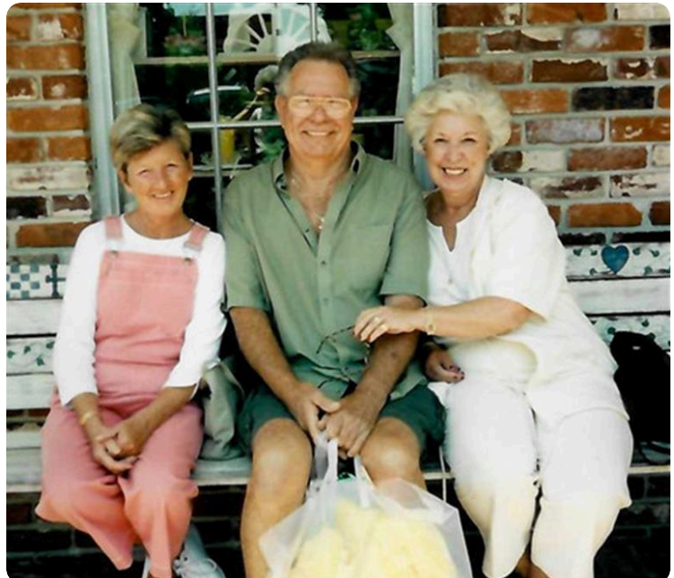
New Photo 1