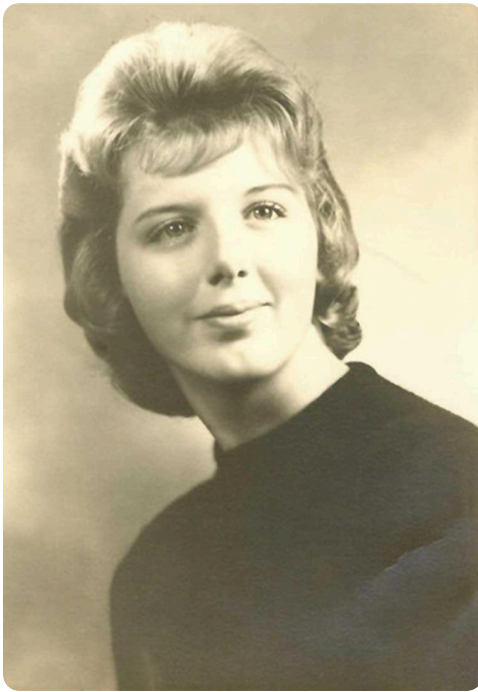
New Photo 1