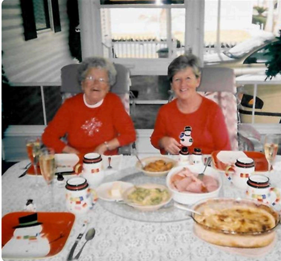
New Photo 1

Shoreline Memorial Services shared 5 photos to the New Album album. December 19 at 7:36 AM