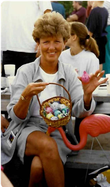
New Photo 1